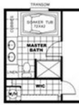
GLAMOUR BATH OPT.

3 beds • 2 baths • 1216 sq.ft. • 16' width • 76' depth